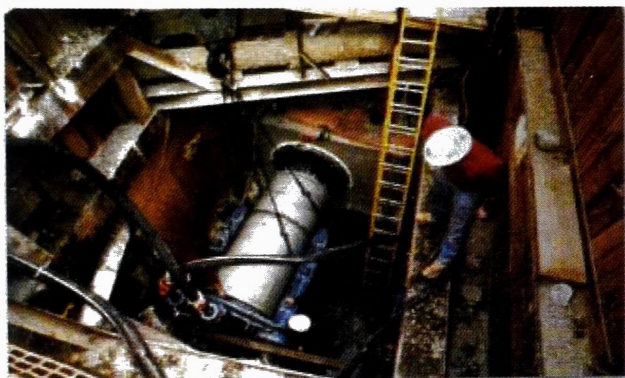
Figure 2- Typical pipe arrangement at the driving end/shaft of micro tunnelling

According to soil investigation results, the sand layers appeared at ground level in general with a layer of hard laterite soil underneath. There was evidence of boulders beneath the hard laterite soil layer. As there was hard soils at all of the proposed elevations of the pipeline soil conditions were found favourable for micro tunnelling. However, arrangements had to be made for continuous dewatering, for a pipe system that would remove crushing material when pipes were being driven, and the injection of sealant material to the annular space between the pipe and the ground during micro tunnelling. To make the operation easier and faster in the presence of hard soil and boulders, lubricant material had to be applied. The pipe arrangement for the exercise is illustrated in Figure 2.