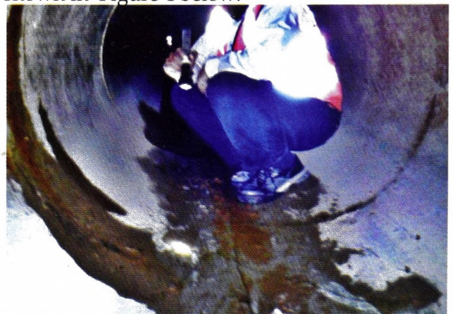
Figure 4 - Cracking of polycrrete pipes

Cracking of polycrrete pipes was noticed at two locations during micro tunnelling. This was again a concern that required detailed investigations. It puzzled the Engineers as they had no previous experience of using polycrrete pipes in micro tunnelling . Micro tunnelling of the Project was carried out using 2.0m polycrrete pipe lengths. As the micro tunnelling machine proceeded towards the soil strata, 2.0m long polycrrete pipes followed one after the other with rubber rings at the joints. A collar was introduced at the pipe joint to withstand the jacking force. The annular space created between the pipe's outer surface and the ground was grouted through a jetting arrangement so that as indicated in Figure 3 the laying of the pipe line could be completed in accordance with the designed elevation and alignment. The cracks that appeared in the micro tunnelled polycrrete pipe section are shown in Figure 4 below.