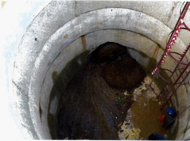
Figure 1 - Micro tunnelling machine emerging from the exit shaft